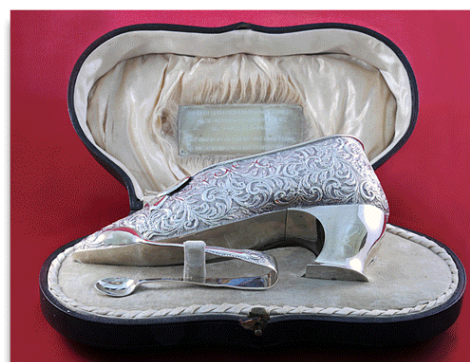
A silver slipper sugar bowl a wedding gift from 'Colonel' Sam Cody