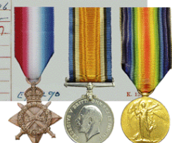
1914-15 British War Victory Star Medal Medal