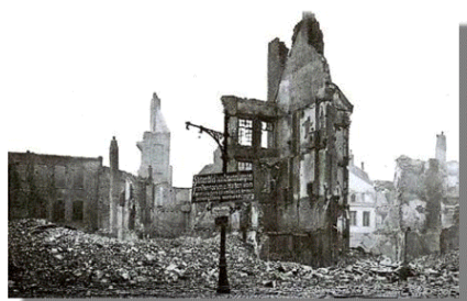
Cambrai and the ruins of the Grand Palace after the battle - 1918